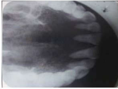
Fig. 5: Occlusal radiograph shows destructive areas on palate.