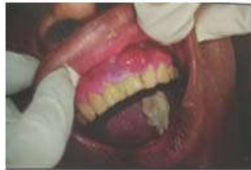
Fig. 2: Intraoral photograph showing enlarged erythematous areas in maxillary anterior gingiva.