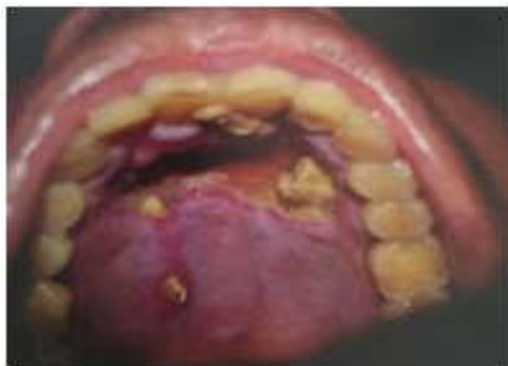
Fig. 3: Intraoral photograph showing necrotic areas in palate.