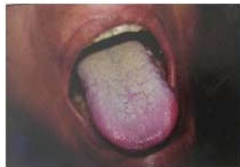
Fig. 4: Candidiasis on dorsum of tongue.